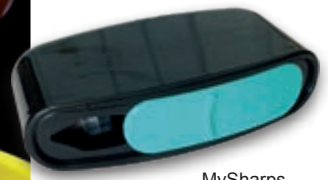
MySharps - new container for used insulin pen needles.